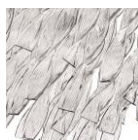
CS "Rigadin" crystal